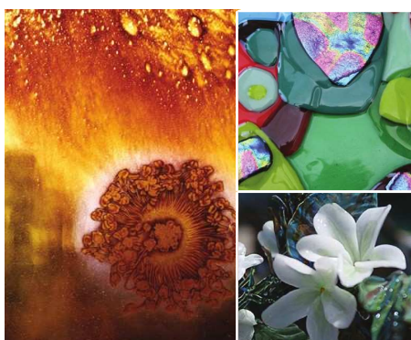
"Reflections on glass" is an exhibition of glass by various artists in the Abbey till January 27.