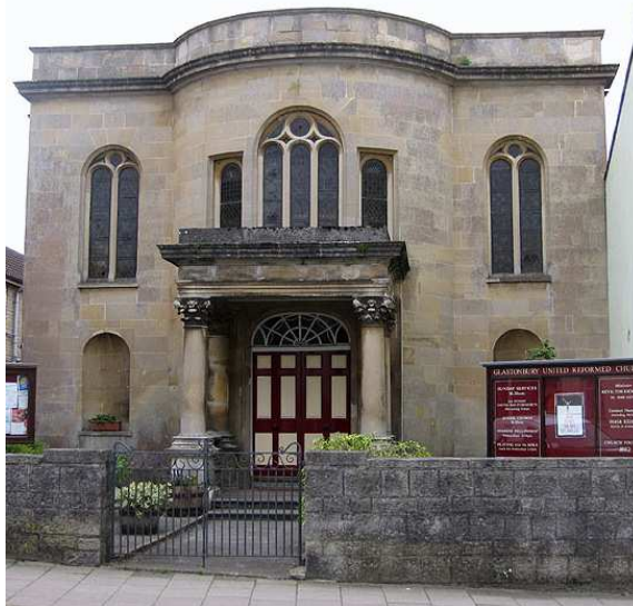
Dissenters met from 1702 in the old Ship Inn in the High Street, rebuilt in 1814 as the "Independent Chapel". The grand portico entrance was added in 1898. Presbyterians merged in 1972 and it became the United Reformed Church.