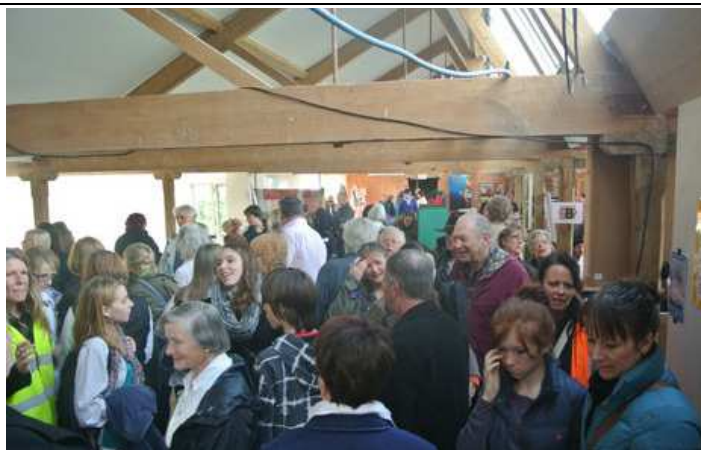
The massive wooden beams and superb north light impressed the crowds. In January, first tenants are expected to move in; nearly all space is booked.

Whitbread and its contractor at the Premier Inn going up next door have donated surplus building materials and offered to asphalt the main path to the Red Brick Building.