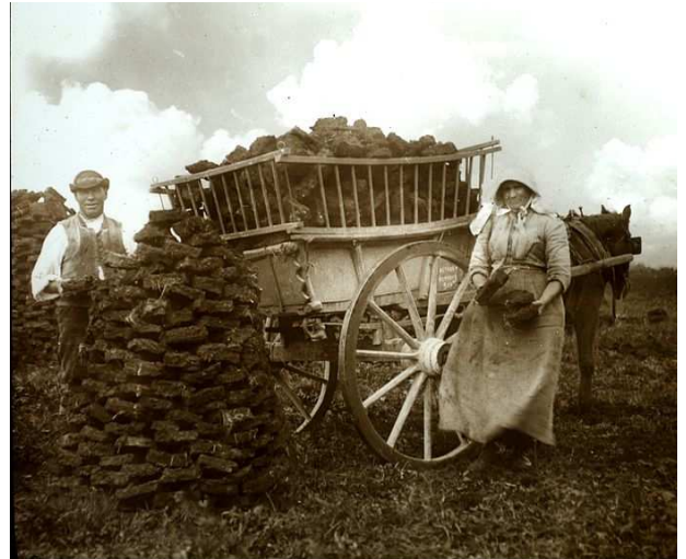
Loading a peat cart at Westhay in 1905. Blocks of cut peat were systematically stacked in "ruckles" (usually much larger than the one in this glass-plate photo) so the air can dry them.

BBC Countryfile ) says that unlike other parts of the country, former peat sites in Somerset have been left in an improved state, as varied habitats for wildlife.