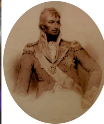
Vice-admiral Sir Samuel Hood, 1762–1814. Like his contemporary Nelson, he lost an arm in battle. His men raised funds to erect the pillar above Butleigh in his memory.