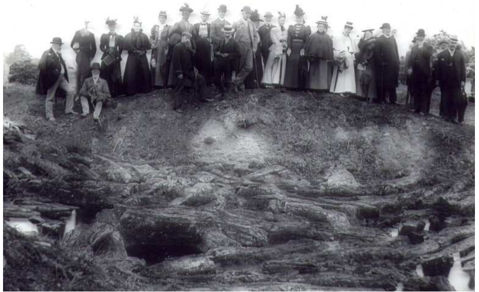
Well-dressed visitors in the 1890s inspect Bulleid's discovery of the iron-age Lake Village between Glastonbury and Godney.

External factors such as climate change and possible falls in nearby water